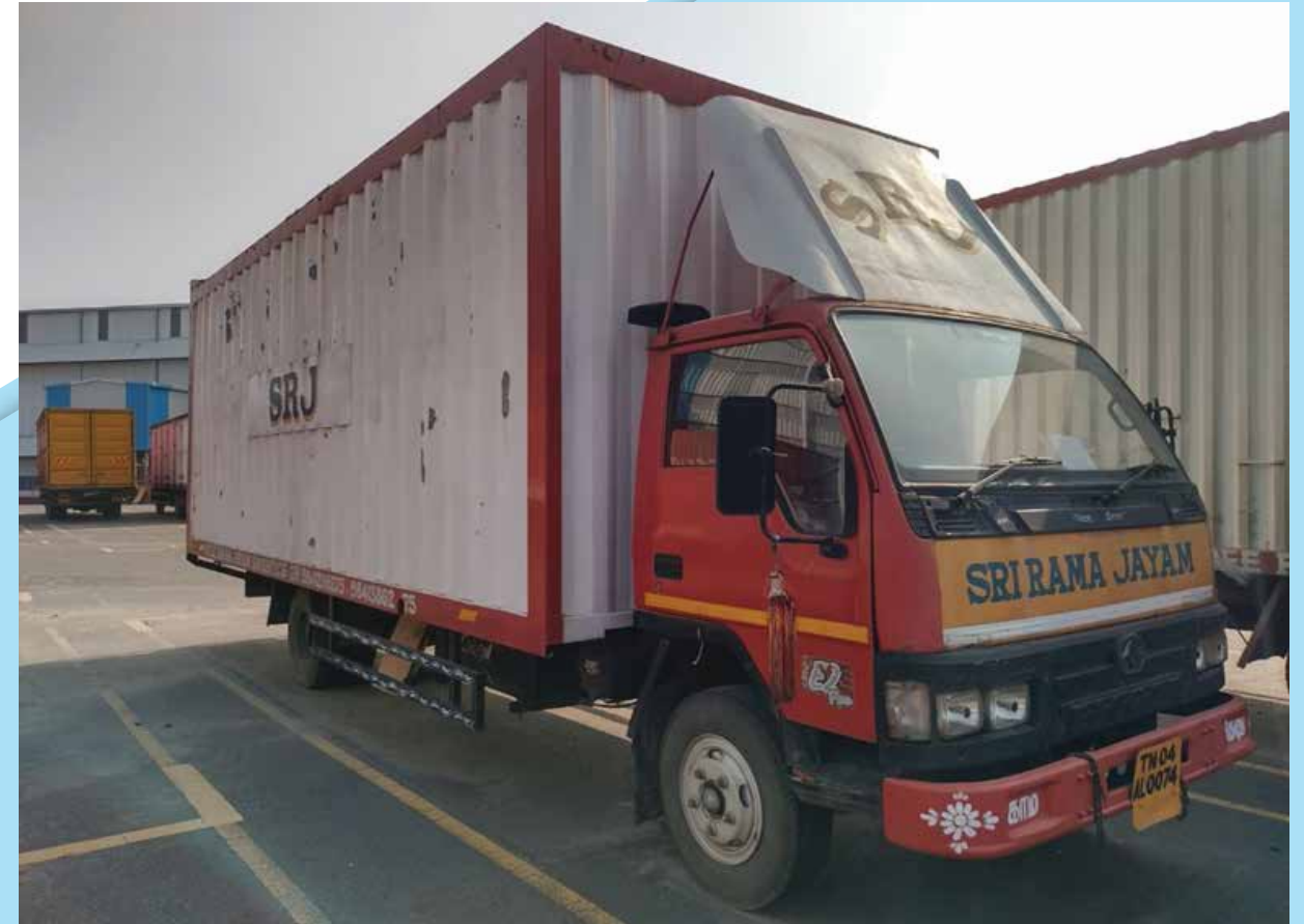
17 FEET ↪ CONTAINER TRUCK