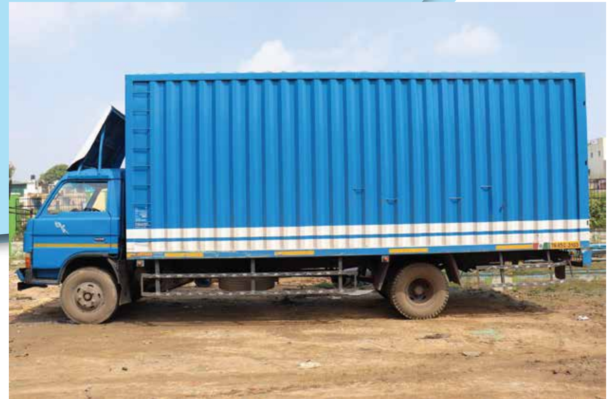
22 FEET (SIDE VIEW)