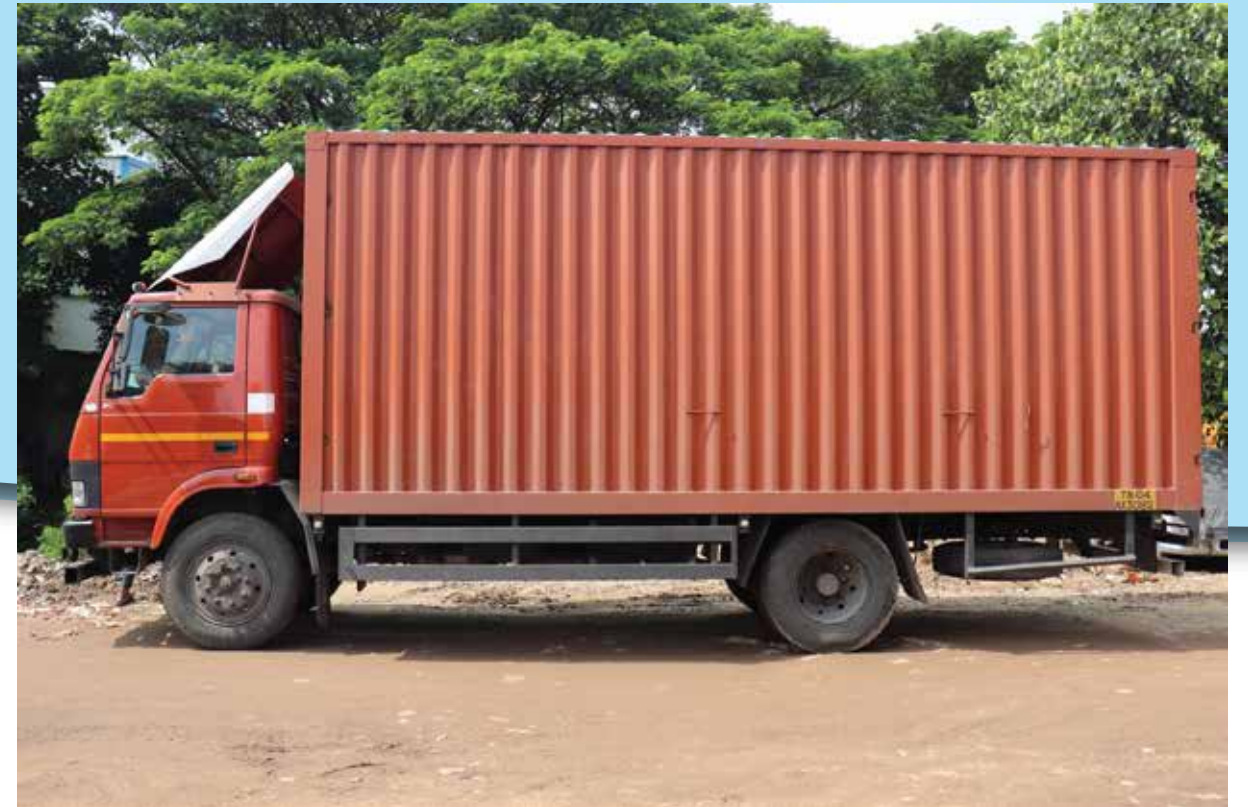
20 FEET (SIDE VIEW)