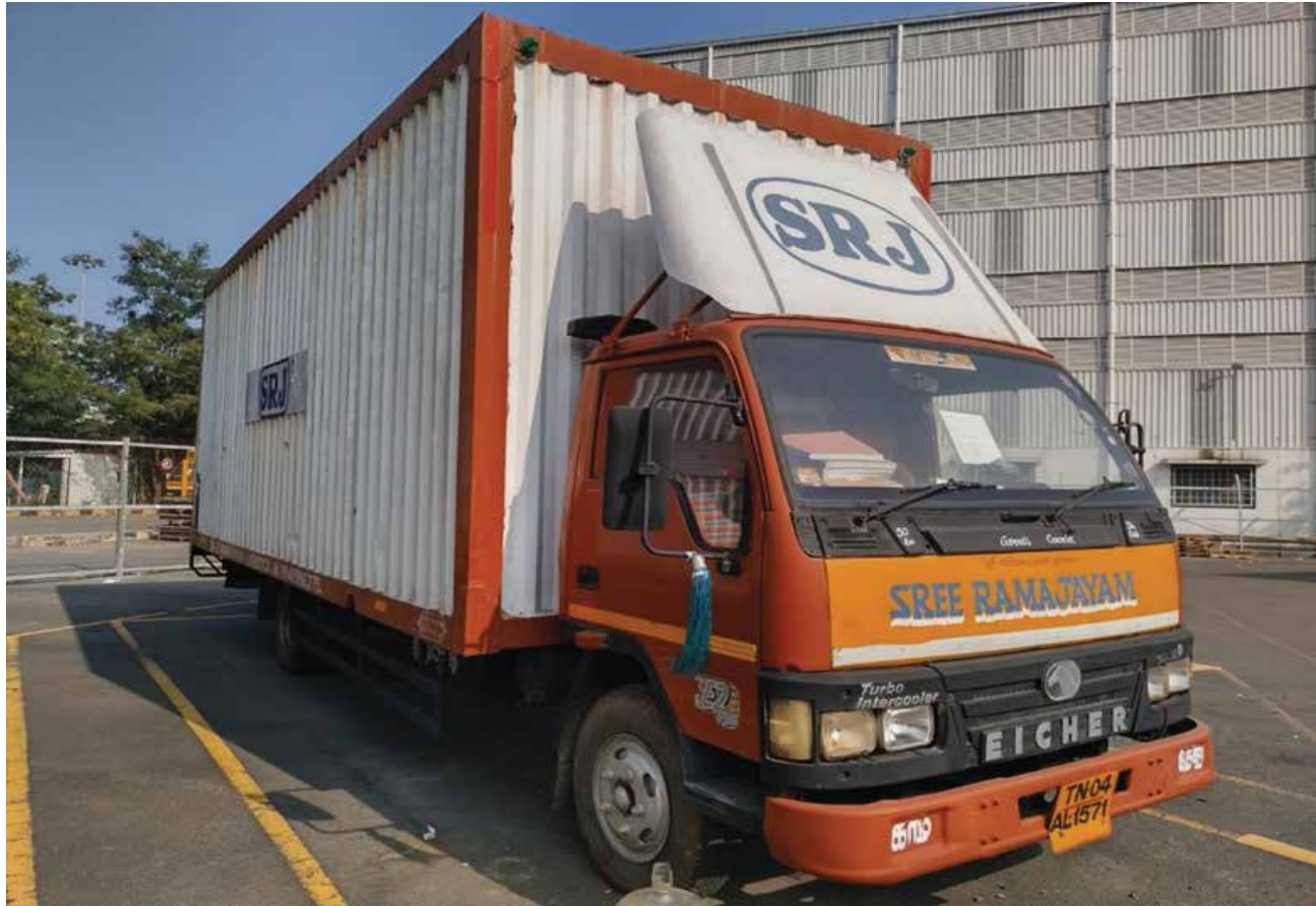
↪ 14 FEET CONTAINER TRUCK