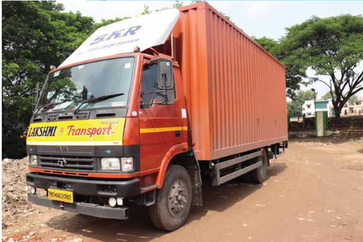
20 FEET CONTAINER TRUCK