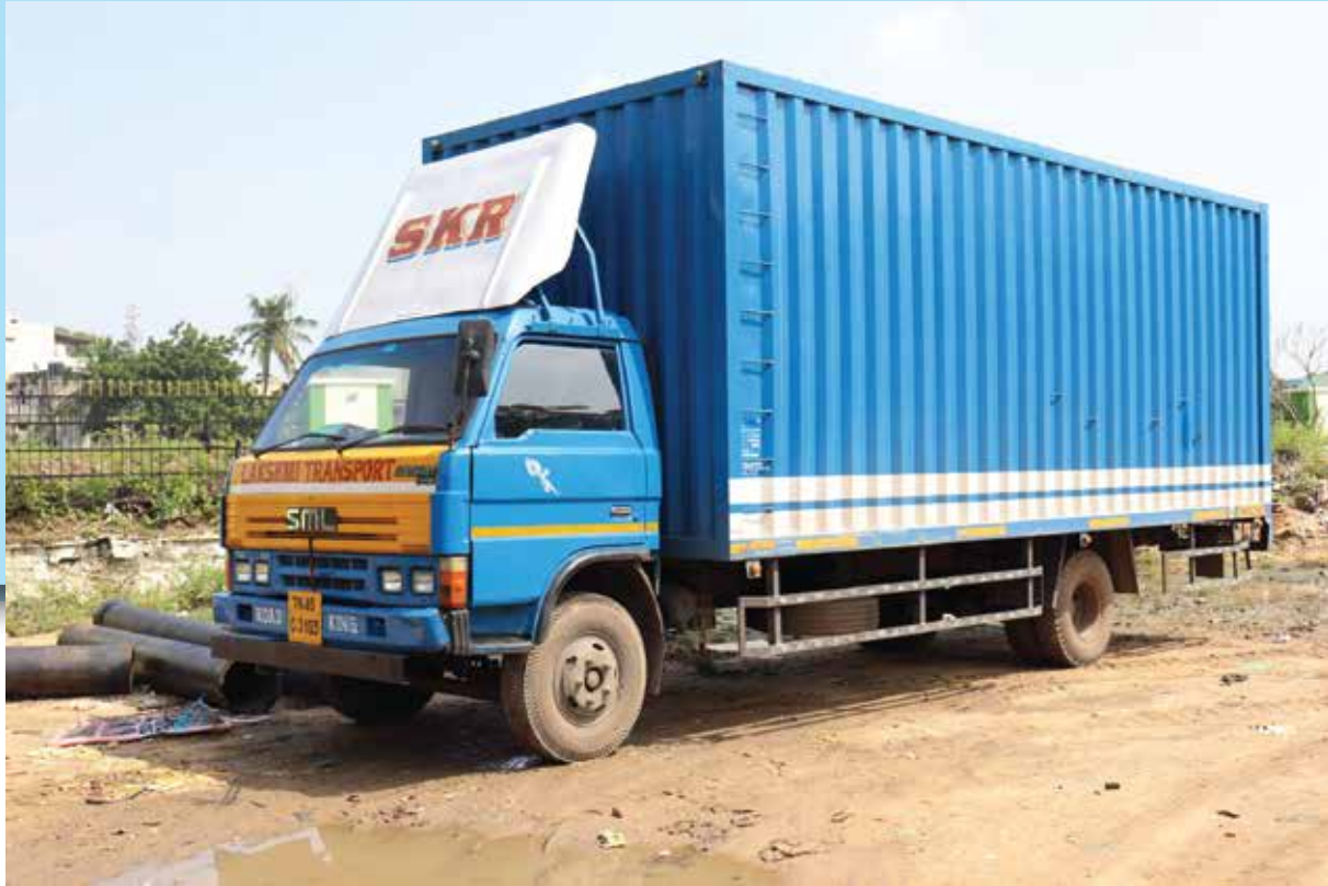
22 FEET CONTAINER TRUCK